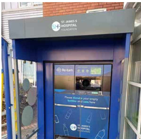
OSPIDÉAL SAN SÉAMAS ST JAMES'S HOSPITAL