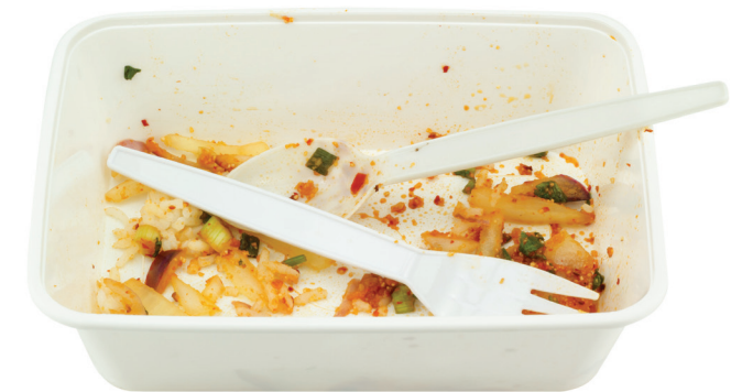
DIRTY FOOD CONTAINERS