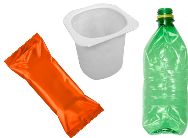
CLEAN PLASTICS (HARD & SOFT)