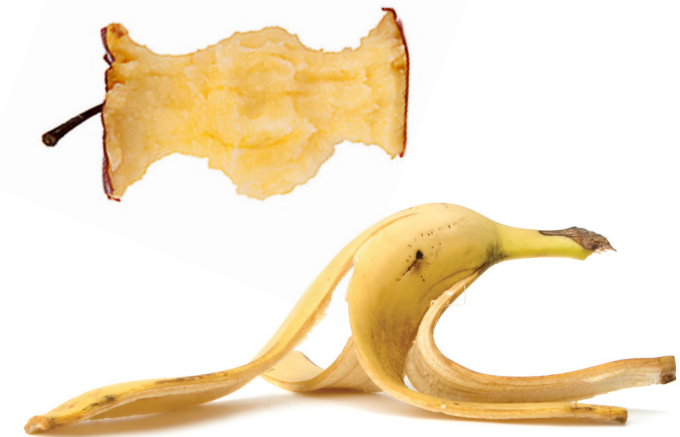
PEELS, SKINS, CORES