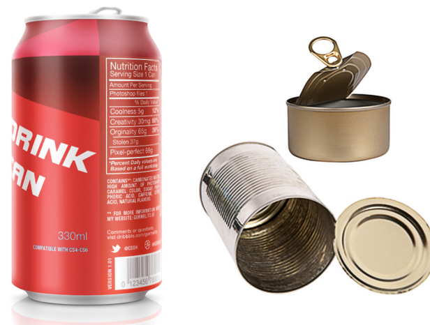
DRINK CANS & FOOD TINS