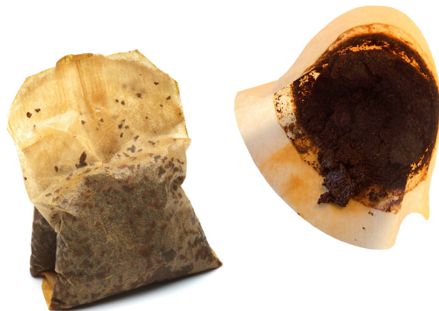
COFFEE FILTERS / TEA BAGS