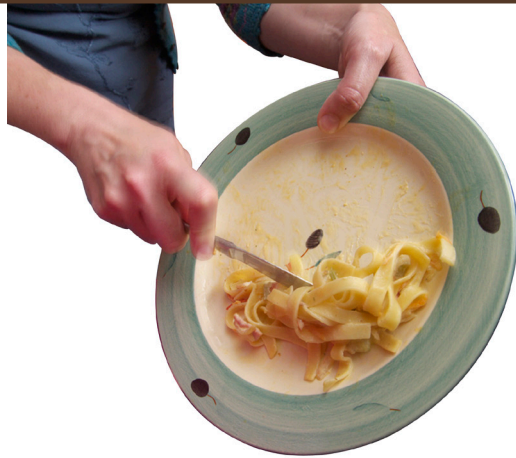
LEFTOVER COOKED FOOD