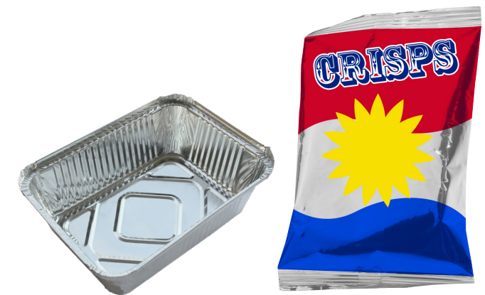
CLEAN FOIL PACKAGING