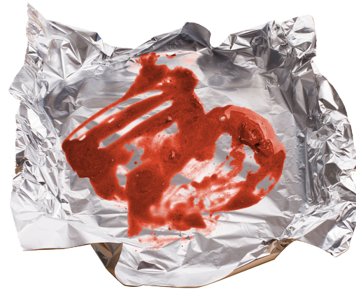
DIRTY FOIL OR FILM