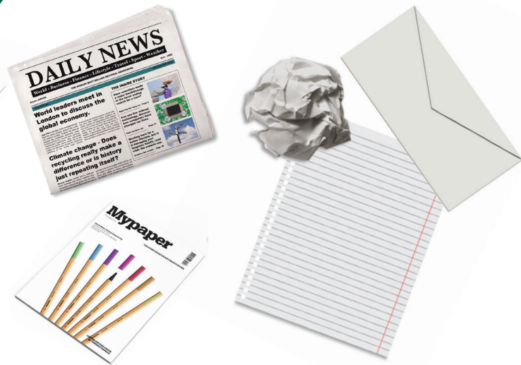
OFFICE PAPER & NEWSPAPER