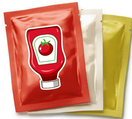
USED SAUCE PACKAGING