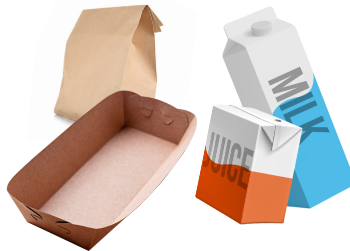
PAPER & CARDBOARD PACKAGING