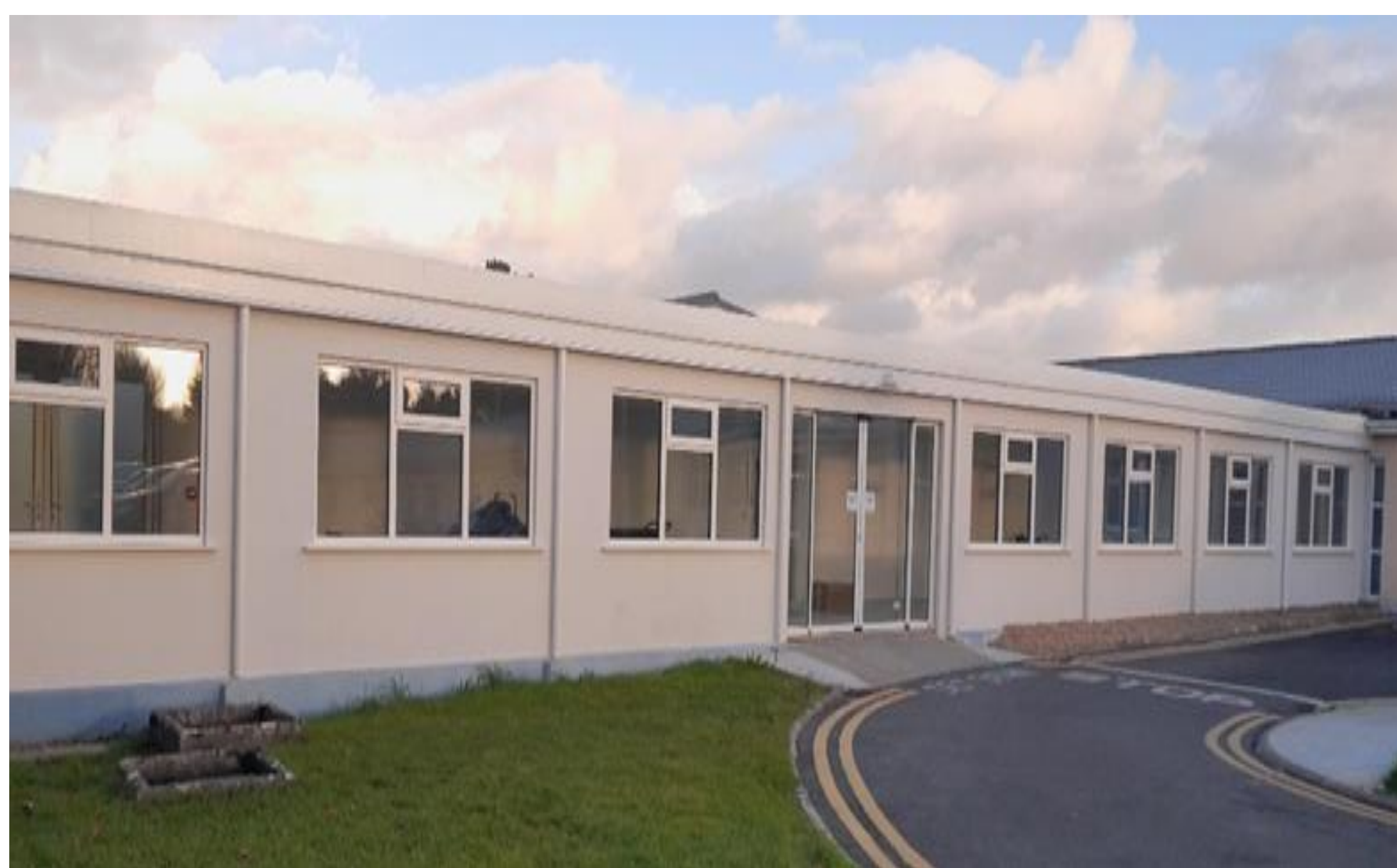
2023, new façade.

The link corridor had a complete fabric upgrade including roof insulation, insulated wall panels and the installation of triple glazed windows and doors. Fluorescent lights were replaced with LED lights with controls. New LST radiators were fitted with thermostatic radiator valves.