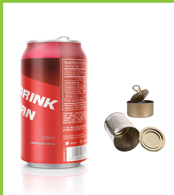
EMPTY STEEL TINS / DRINK TINS