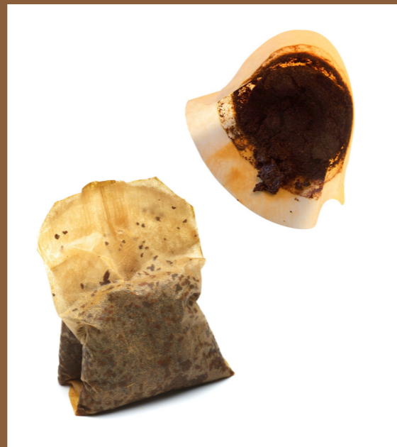
COFFEE FILTERS / TEA BAGS