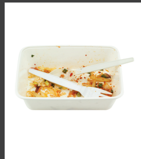
CONTAMINATED FOOD PACKAGING