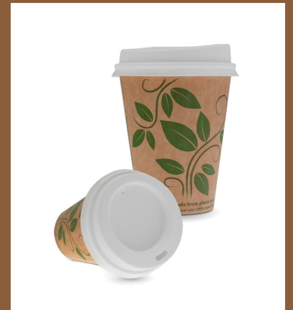
COMPOSTABLE COFFEE CUPS