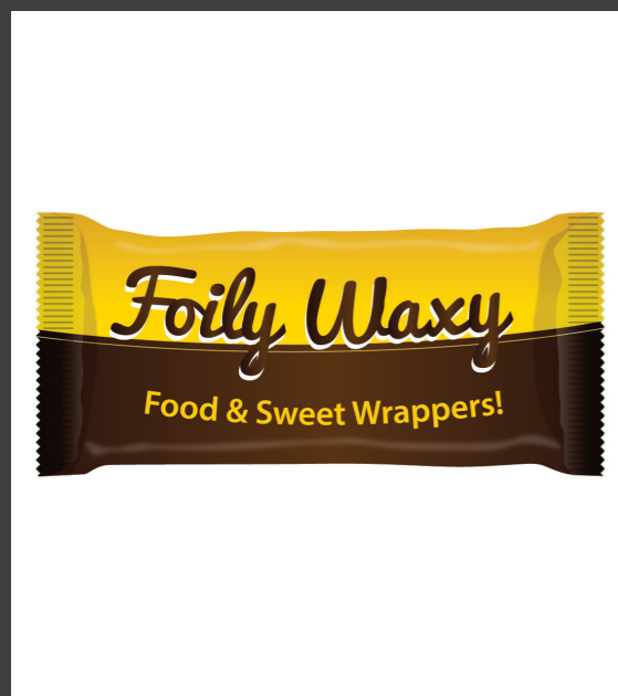
FOIL SWEET WRAPPERS