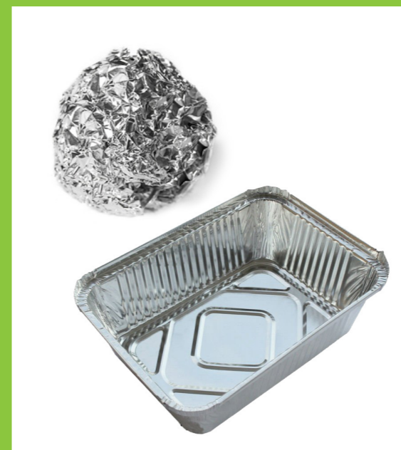
CLEAN ALUMINIUM FOIL