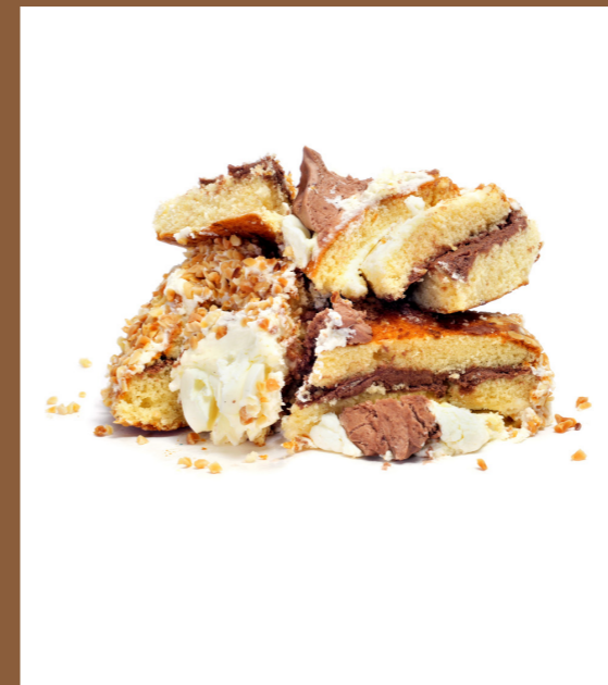
CAKE / BAKED GOODS