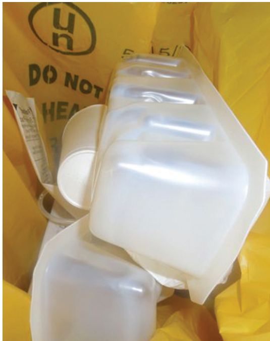
An example of clean composite packaging in a clinical risk waste bin